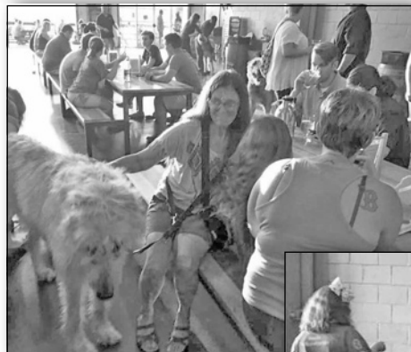
Dalriada Gormaine-Breagha Cu Brash & Glasnevin O'Canusa Cu Brash

FRIDAY, AUGUST 10TH CELEBRATING THE DOG DAYS OF SUMMER BY GETTING TOGETHER FOR SOME PINTS 'N' PUPS AT O'CONNOR BREWING CO.