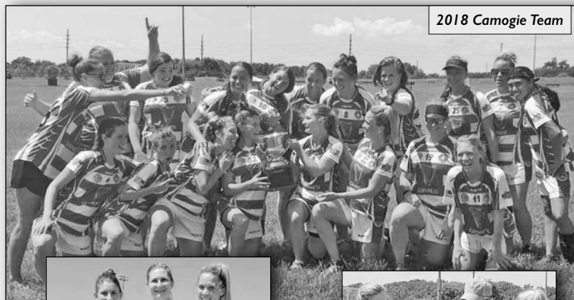
2018 Camogie Team

Both the Coastal Virginia Hurling and Camogie teams are going to Philadelphia Labor Day Weekend to compete in the 2018 National Championships so wish them luck!