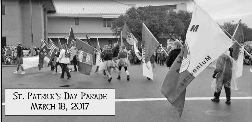
ST. PATRICK'S DAY PARADE MARCH 18, 2017