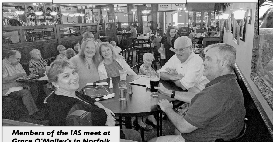
Members of the IAS meet at Grace O'Malley's in Norfolk

(A new feature, from time-to-time. If you have photos of your adventures and travels that include pubs, please submit them to the editor for future publication!)