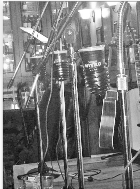
What's a pub without music! A stage set for Glasgow Kiss at Grace O'Malley's in Norfolk